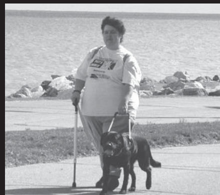
The scenic route along the Kenosha lakefront led to the Civil War Museum and a hearty lunch . . . all while raising funds for the Society's Assets Transportation Fund.